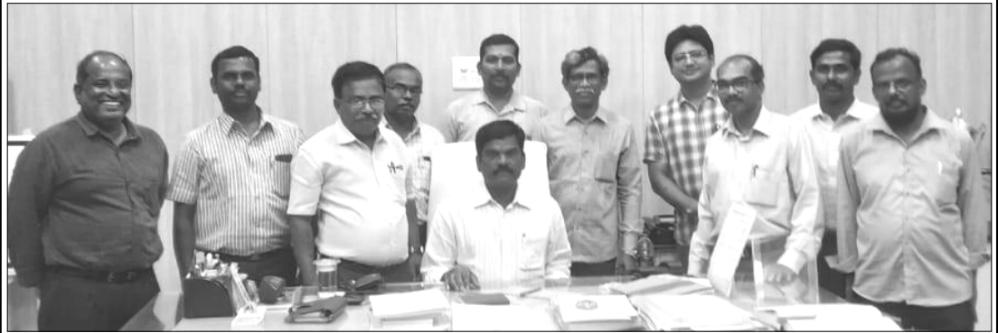
புதியதாக பொறுப்பேற்ற நமது தலைமைச் சங்கப் பொறுப்பாளர்கள், முதன்மைத் தலைமைப் பொறியாளர், நீ.ஆ.அ. , மற்றும் தலைமைப் பொறியாளர் (பொது), பொப்து மற்றும் முதன்மைத் தலைமைப் பொறியாளர் (கட்டடம்) மற்றும் தலைமைப் பொறியாளர் (கட்டடம்), சென்னை மண்டலம், பொப்து அவர்களையும் நேரில் சந்தித்து வாழ்த்துக்களைப் பெற்றனர்.